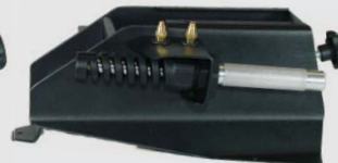
stand-SW (without tools) Art.-Nr. 44-07-45510252