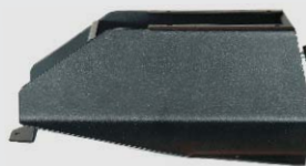
stand-S Art.-Nr. 44-07-45510250