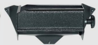
wall holder (W) Art.-Nr. 44-07-45510253